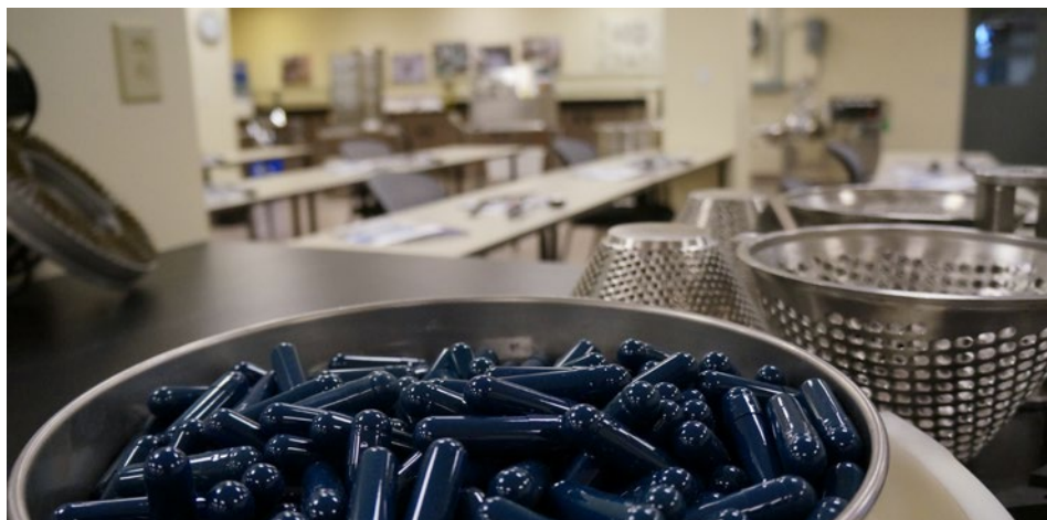
Techceuticals Solid Dose Training Facility

Units of operation in solid dose manufacturing are driven by setup, operation, cleaning and maintenance procedures. However, each operation is dependent on the one before it and success is cumulative. Results come from understanding the complete process. This program is designed to promote discussion and interaction between each of the manufacturing areas.